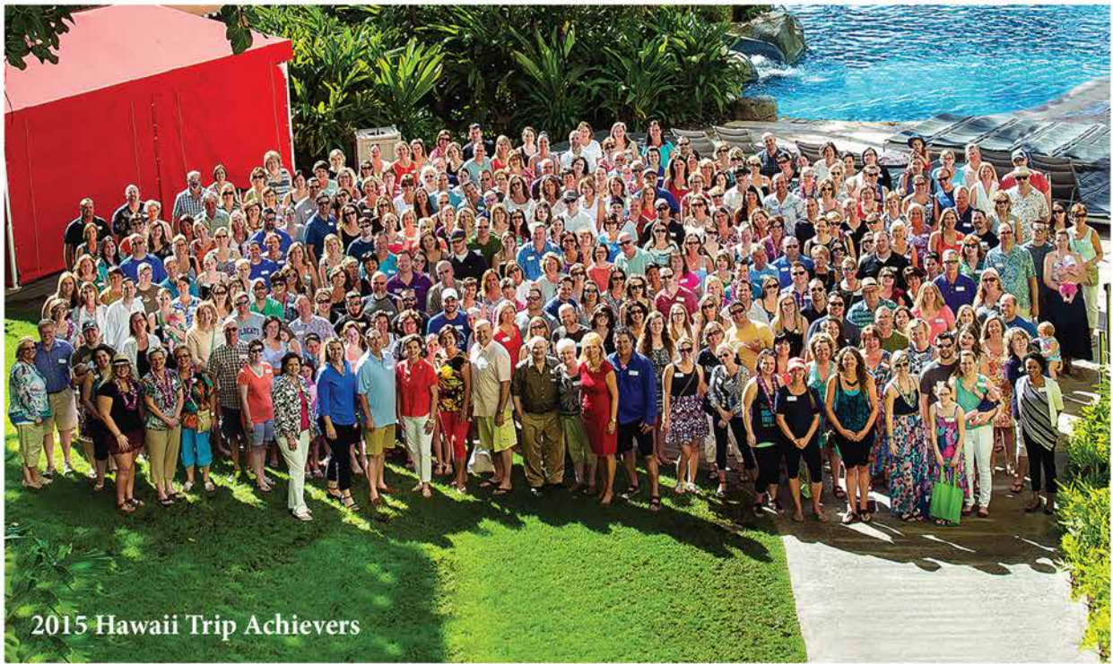
2015 Hawaii Trip Achievers

Witness remarkable sunsets, explore amazing landscapes and create memories that will last a lifetime.