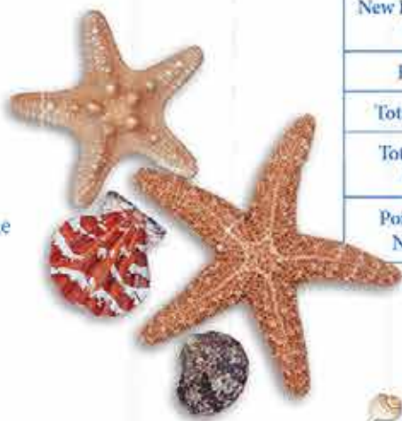
Chart Your Course For Paradise

1 A Personal Eligible Recruit is defined as a Consultant who submits a minimum of $250 in Subtotal A Sales during the Commissionable Month they join Norwex.